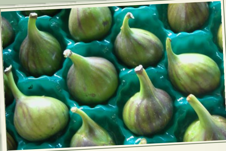
BROWN TURKEY FIGS