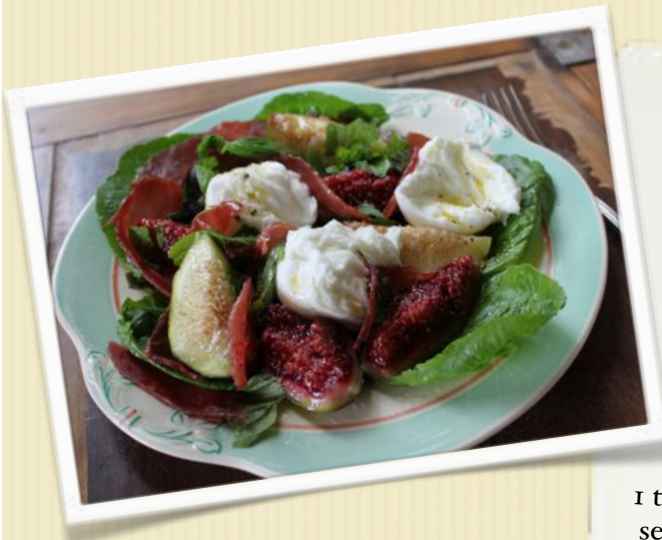
FIG AND BOCCONCINI SALAD